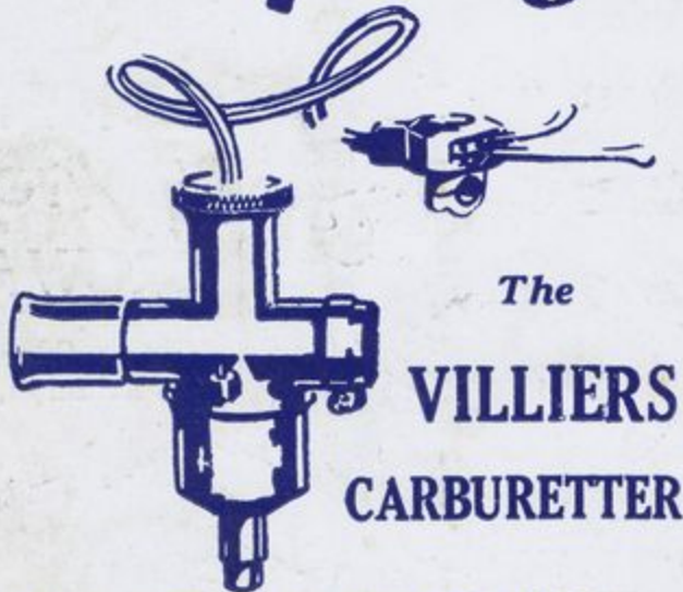
The VILLIERS CARBURETTER

... is as simple as the VILLIERS Engine. It is self-regulating and economical. It controls automatically the strength of the mixture at all times, seeing that the engine is never starved, nor yet choked with too much fuel. This Carburetter will suit all types of engines.