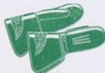
Wing Cuff Mitts