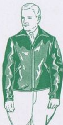
Neat and Trim

This quality all leather jacket is made of full grain black horsehide, soft and pliable, and is shower and wind proof. It is lined thruout with a high grade black moleskin cloth of exceptional wearing qualities. Has Cossack waist band fitted with take up strap to insure a good fit.