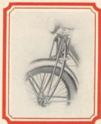
NEW FRONT FORK

Most accessible motor built; remove cylinder head without disturbing carburetor, manifold, valves or exhaust pipe; scrape carbon and re-assemble in 20 minutes.